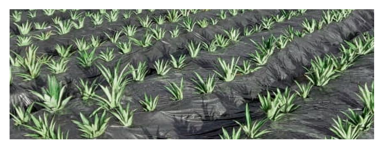
Fig.3 Double row planting system of Pineapple.